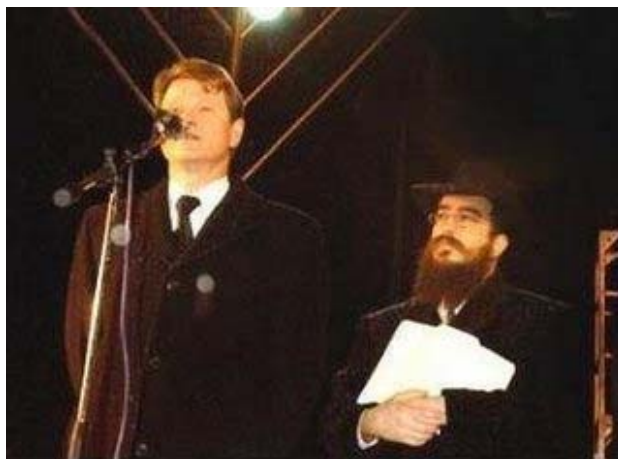
Lithuania - President Rolandas Paksas